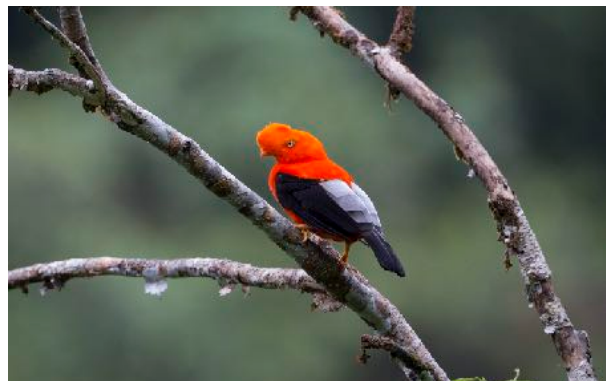
Andean Cock-of-the-Rock (Holbrook)