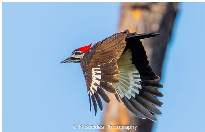
Pileated Woodpecker by Noriko Buckles

The March outing was to the Anclote River Park in the late afternoon to photograph two totally different situations. First we were to photograph birds in flight where the shutter speed setting was set to very high to capture the flying birds. We were able to see and photograph Osprey, Bald Eagles, Brown Pelicans, gulls, Palm Warblers, Nanday Parakeets and Eastern Bluebirds. After visiting a Bald Eagle nest we headed to Anclote Gulf Park to photograph the sunset. Here we switched our camera settings to aperture priority using high f-stop to get everything in focus from near to afar. Sunset was very dramatic, with the clouds lighting up, and as a bonus we saw a bull shark being reeled in by a fisherman. What a way to end the evening!