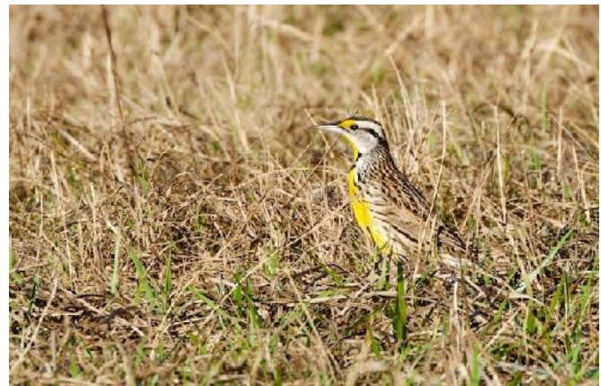
Eastern Meadowlark