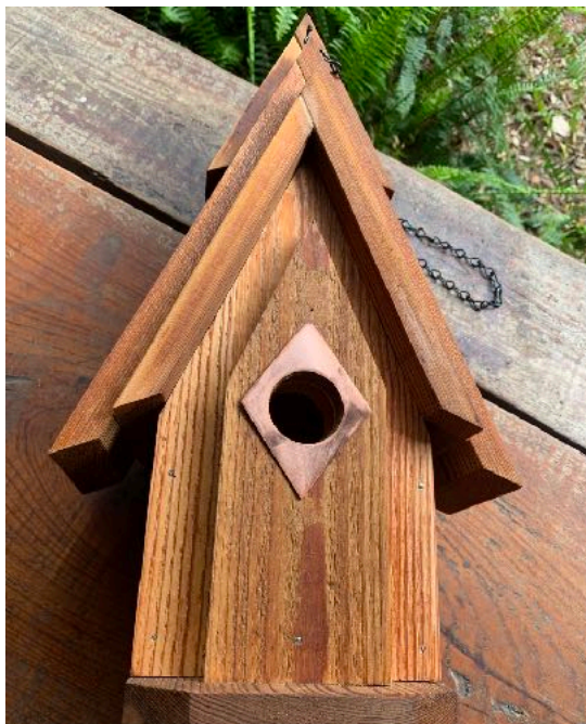
Handcrafted Nesting Box