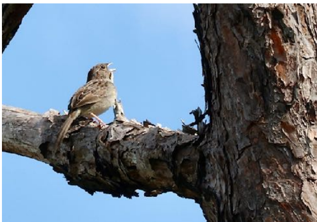
Bachman's Sparrow