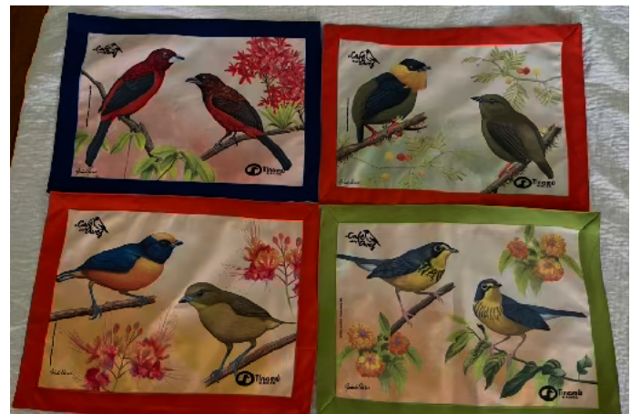
Cloth Place Mats from Tinamu Lodge, Colombia