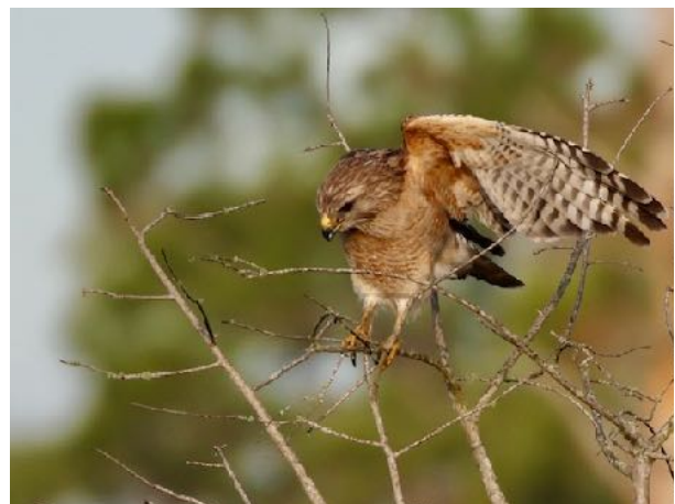
Red-shouldered Hawk