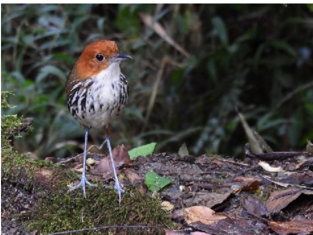
Chestnut-crowned Antpitta by Christine Rowland

Over our 7 days of solid birding we were welcomed everywhere we went by the hospitable people of Colombia, and had a chance to experience many different habitats. For a day-by-day account, please see the narrative on our trip report at https://ebird.org/tripreport/487525 , where you will be also able to see a full list of species and photographs of most of the species we saw. Our group saw a total of 286 species during our visit - for many of us topping over 200 'lifers', and obtaining photographs of most of the species we saw. We plan to share our photographs and experiences with you at our 2026-7 season opener on October 3rd.