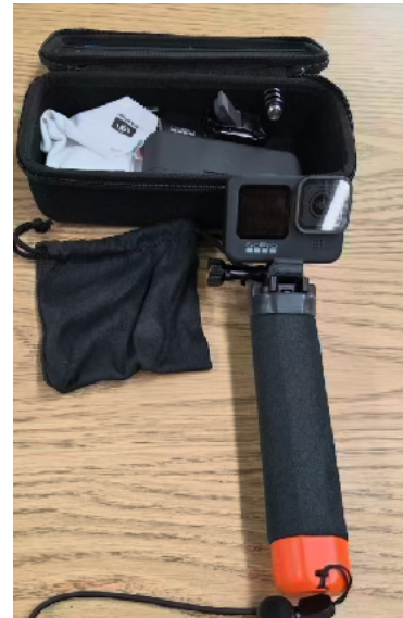
GoPro Hero 9 camera kit