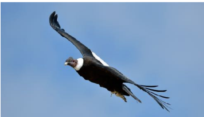
Andean Condor