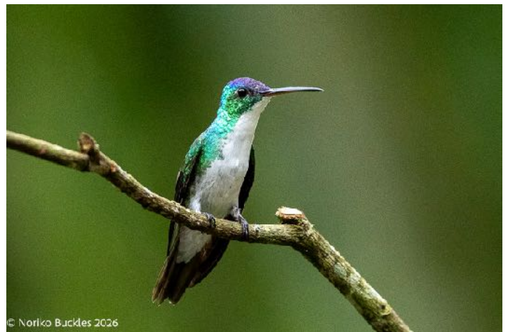
Andean Emerald by Noriko Buckles