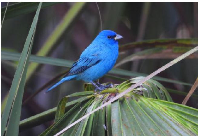
Indigo Bunting by Christine Rowland

We had intended to follow this location with a visit to Terra Ceia State Park, but as we took our time on the trails at Felts, we made a plan change and decided instead to visit nearby Sweet Bay nursery for some native plants. Upon arrival Joe Colantonio took us all back to a special viewing spot for a nest of Great Horned Owls, with two owlets in the nest - it was a wonderful bonus that most of us had not anticipated and a very positive way to conclude our trip.