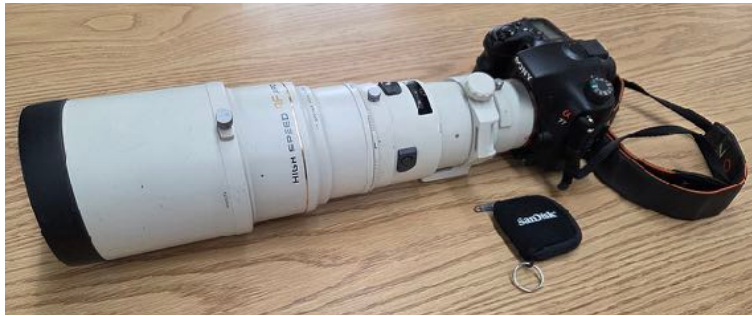
Sony A77 camera, 400mm f4.5 lens, battery, charger + card

To this end, we have a number of interesting items available to bid on in our silent auction. Some of the items are shown below. Additionally, the following businesses have donated gift cards: Argento's, Home Depot, Publix, Sprouts, Sam's NY Pizza. Thank you so much to all of the local businesses - these contributions will certainly help us advance our work.