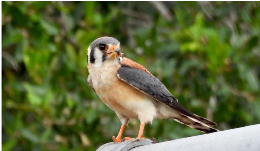
Southeastern American Kestrel at Arthur Engle Park last June

The imperiled Southeastern American Kestrel, a small non-migratory falcon, lives in open sandhills, prairies, and pastures, and increasingly in some of our urban areas. FWC researchers are continuing their study of urban-dwelling kestrels in the Tampa Bay region. We need your help locating urban and suburban nests in Pasco, Pinellas, and Hillsborough counties! If you have information that you would like to share, please visit Rare Upland Bird Sightings to enter your sightings and photographs. Nesting behavior during mid-April through mid-July is especially of interest. For more information, please contact Dr. Karl Miller at karl.miller@myfwc.com or karl.miller.bird@gmail.com .